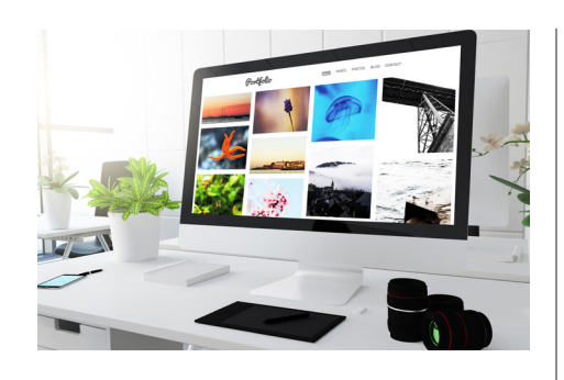
POWER POINT/VIDEO – A visual document of the job seeker used to market one's knowledge, skills, and abilities to the hire authority.

Strategies to market the job seekers contributions and find the best fit for employment to support Discovery and Customized Employment